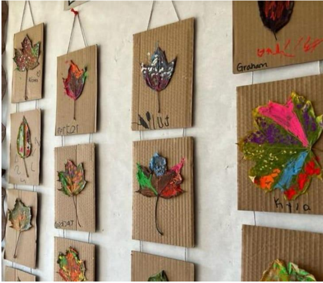
(Sample for Hanging)

Different shapes of leaves animal faces from different plants.