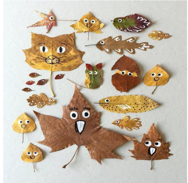
(Sample for Animals faces)