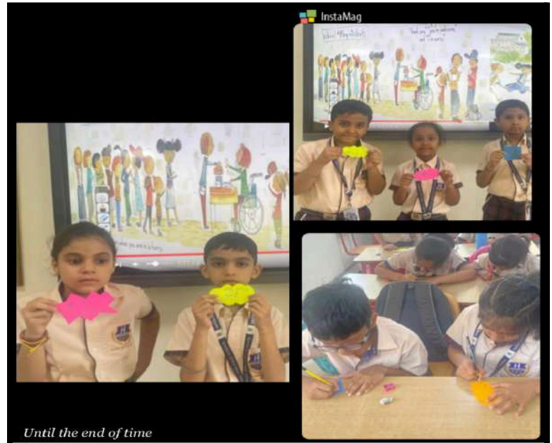
Until the end of time